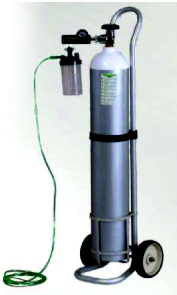
Medical Grade Cylinder Model No : ACE- 10L-152

in Defence Research and Development Organisation (DRDO) has developed SpO 2 (Blood Oxygen Saturation) supplemental Oxygen Delivery System for soldiers posted at extreme high-altitude areas. Developed by Defence Bio-Engineering & Electro Medical Laboratory (DEBEL), Bengaluru of DRDO, the system delivers supplemental oxygen based on the SpO 2 levels and prevents the person from sinking in to a state of Hypoxia, which is fatal in most cases, if sets in. This automatic system can also prove to be a boon during the current Covid-19 situation.