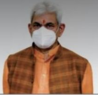
Shri Manoj Sinha Hon'ble Lieutenant Governor