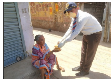
Meal distribution in Patna