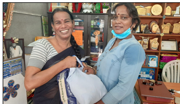
Distribution of ration in the Transgender Community