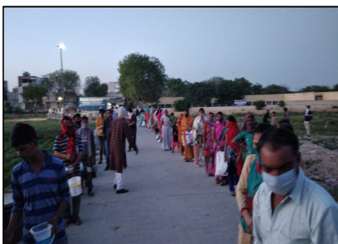
Roseate Hotel's Distribution of meals in Delhi