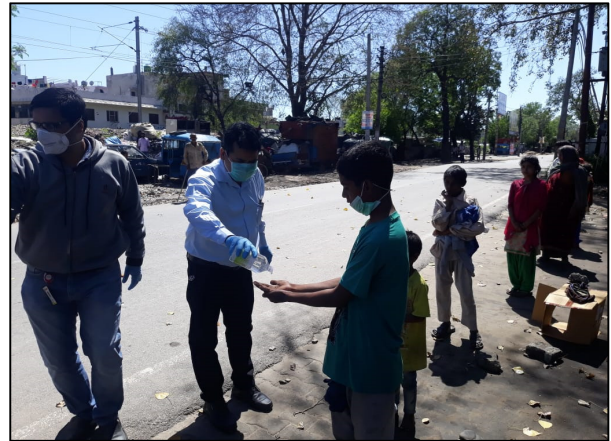
Haridwar Distribution of Meals