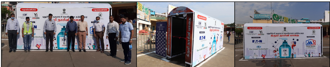
Disinfection Tunnel in Puducherry