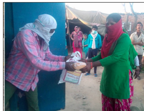
Yi Delhi Distribution

Yi Erode: CII- Yi Erode Chapter members with the support of Kongu Engineering College installed two disinfectant tunnels at the Perundurai bustand and GTS Schools which is now converted to a vegetable market. The chapter also distributed 2,525 cooked food packets to the underprivileged people of the area.