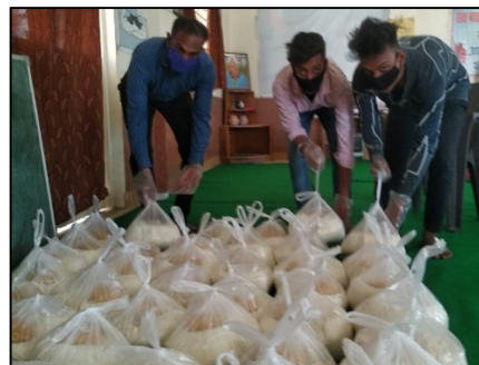
Food Distribution with Yi Bhopal

Yi Bhopal: This chapter, with the support of Seva Bharti, distributed cooked and raw food through 22 kitchens established in Bhopal at various locations. The Chapter also distributed soaps and ration to all the people living in Bhopal slums. So far, about 1,200 ration packets and 2,000 soaps have been distributed amongst the daily wage labourers in Bhopal. Furthering the support, Yi chapter members have contributed Rs 1 lakh to Police department to arrange for refreshments for 500 police officials and various volunteers working towards COVID – 19 relief. Chapter members with the support of Akshay Patra and LNCT University prepared 50,000 raw food packets of ration provisions and distributed 10,000 packets to the indigent people.