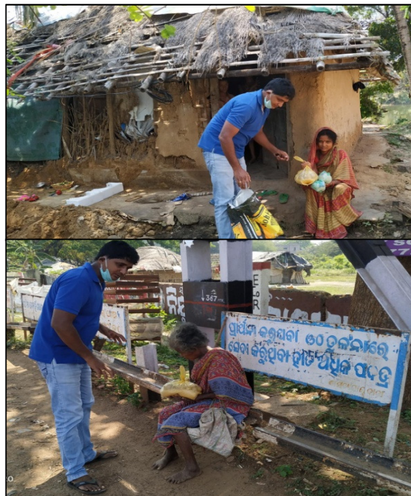
Distribution of food among the leprosy affected in Jajpur, Odisha

5,000 masks (manufactured by the women Self Help Groups of JSPL Foundation) and 5,000 sanitizers were distributed in Angul . 200 isolation beds were provided in Balasore to the District Administration. In Kalinga Nagar , 3,000 beneficiaries were served with cooked food and 1,500 ration kits were distributed. Pradeep Phosphates has distributed 3,000 cooked meals to the slum dwellers in the city of Paradeep . In collaboration with Jindal Stainless Steel, cooked meals were distributed among 53 families across 3 communities in Jajpur , where the main beneficiaries were from underprivileged families having leprosy affected members. In Cuttack, distribution of cooked meals was undertaken, 500 meals are distributed every day. Hotel Mayfair in Bhubaneshwar has provided masks, gloves, sanitizers and thermal monitors for the 30 staffers and also provides cooked food and rooms for them.