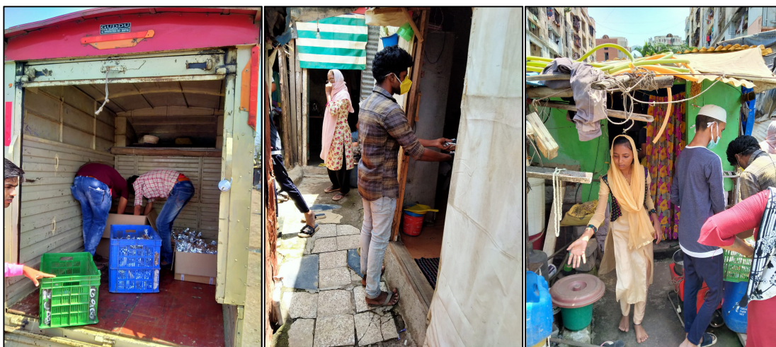
Distribution at Mankhurd