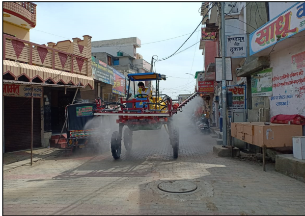
Sanitization Drive in Haryana