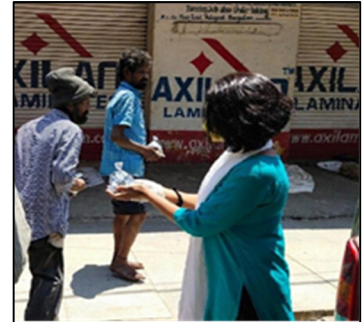
Distribution in Bengaluru

Yi Bengaluru: Yi Bengaluru Chapter distributed food packets to 300 people in collaboration with the Bruhat Bengaluru Mahanagara Palike (BBMP). Bengaluru chapter members identified 50 migrant labourers from Orissa and distributed staples and ration provisions in Whitefield area. Chapter members have distributed 3,105 ration kits in various underprivileged community in the city.