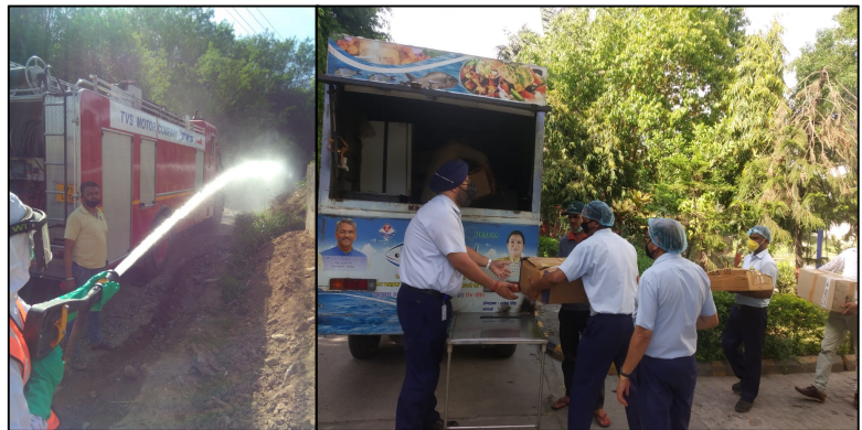
Distribution of ration kits and sanitization in Himachal Pradesh with TVS

With support of TVS, ration kits and cooked meals were provided to the needy in Hosur and Mysore in Karnataka in partnership with city Police Departments, and in Solan in Himachal Pradesh in partnership with Baddi Barotiwala Nalagarh Industries Association.