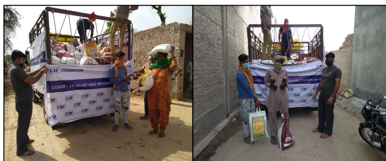
Ration Kit distribution in Sirsa, Haryana

Working with farmers in 110 villages in Ludhiana and Patiala, Punjab and 10 villages in Fatehabad and Sirsa, Haryana , CII Foundation is promoting safe hygienic practices. An awareness drive is being run through a network of farmer volunteers, with support of NGO partners GBDSGNS Foundation and Doctors For You.