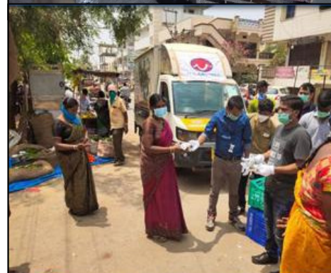
Relief work in Telangana