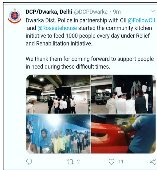
Dwarka Dist. Police's tweet on partnering with CII

In Delhi , 5,000 sanitizers have been distributed in various parts of Delhi by CII Delhi State Office, and in association with the Delhi police, 5000 masks have been distributed. CII, in partnership with Roseate Hotel and Le Meridien Hotel, is providing cooked food packets to 500 people and 400 people respectively. In partnership with NGO Pravah, sanitizers and masks were provided to 900 daily wage labourers. 500 Kgs of ration was distributed among 85 labourers through NGO Serve Samaan, and 900 ration kits were distributed in East Delhi through the support of the NGO SEEDS. In collaboration with Oxfam, cooked meals are being distributed among the migrant labourers in 7 locations in Delhi. Till date, 20,435 meals have been distributed.