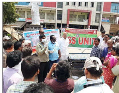
Amaravathi chapter awareness session

Yi Amaravathi: Chapter members distributed sanitizers for around 100 people at Tenali area.