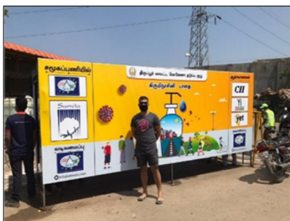
Disinfection Tunnel for essential services, Yi Tiruppur

Yi Kolkata: Yi Kolkata Chapter members with support of police started distributing ration kits to the St Joseph's Old Age Home covering 150 elderly people and supporting the village of Uttar Bilandopur with food essentials. A total of 1,050 ration packets have been distributed in the city.