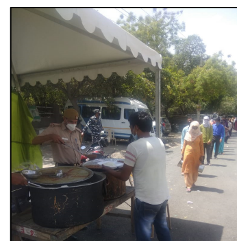
Le Meridien' Distribution of Meals