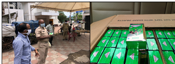
Distribution of Glucose in Kochi

Yi Kochi: Chapter members distributed food packets, clothes to 1,300 migrant workers, laborers and destitute in various camps in Kerala. They have also served 1,000 packets of Glucose to the police officials on duty.