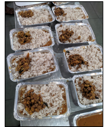
Meal distribution in Kerala