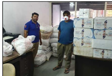
Procurement of material in Ahmedabad

Yi Ahmedabad: Yi Ahmedabad Chapter members distributed milk and grocery kits to 970 slum dweller families at Old Vadaj, Bhimajipur. Chapter members with the support of Weizmann Ltd Ahmedabad, distributed one-month ration provision to its 600 Daily wage employees. 1,000 anti COVID-19 sanitizing kits consisting of mask, gloves, sanitizer, soap & paper napkin to Western Railway, Ahmedabad Division on duty staff including Home Guards.