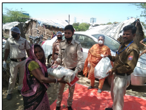
Distribution of Ration kits with SEEDS