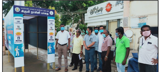
Disinfection Tunnel in Thoothukudi

In Thoothukudi, 2,600 mask, 1,40,000 Gloves, 25 PPE suits and sanitizers have been distributed within the city and government offices. An approximate of over 1.4 lakh beneficiaries have benefitted from these initiatives.