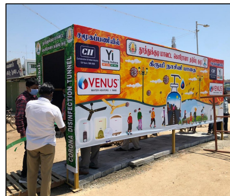
Disinfectant tunnel in Thoothukudi

Yi Thoothukudi: Yi Thoothukudi Chapter members distributed 1,000 masks, 15,000 gloves to the police department in the Nagarcoil area, 10 Safety dresses to the SP Office in Tirunelveli. 50,000 gloves to the government hospital, 15,000 gloves to banking sectors and 25,000 gloves were given to the Kerala police as a part of the relief measures. CII- Yi Thoothukudi Chapter members with the support of local district administration installed three disinfectant tunnels for the benefit of the public.