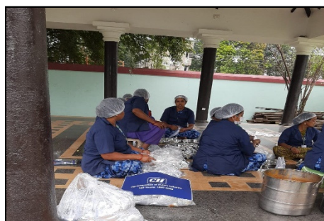
Ration kits Distribution in Bhilai, Chhatisgarh

Durg: Akshaya Patra Foundation is also providing 4,600 cooked meals every day in Durg. In Raipur , 3,850 ration kits and cooked meals have been distributed by the municipal corporation.