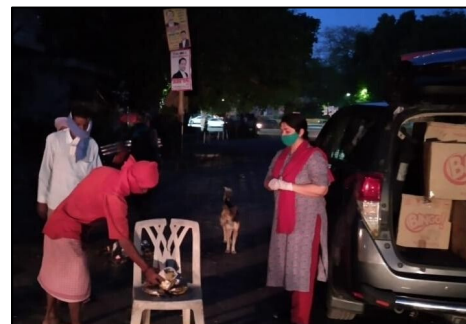
Distribution in Lucknow

Yi Hubballi: Yi Hubballi members distributed 137 packed lunches to the needy and old people in the city with the permission from City Commission. CII- Yi Hubballi chapter launched the disinfectant tunnel at the APMC Market for the use of public.