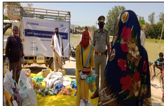
Distribution of Ration kits in Jaunpur