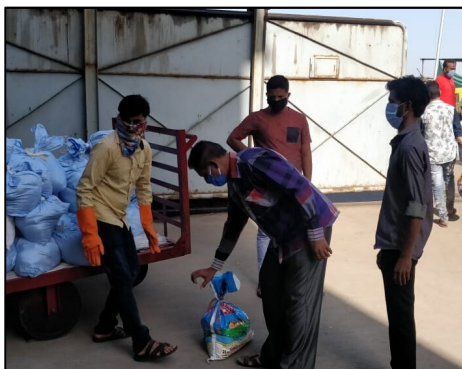
Distribution in Ahmedabad

Yi Madurai: Yi Madurai Chapter members supported 480 destitute families by providing hygiene items, hydration, packed food, medical supplies, food grains and monetary support. The camp was supported by a local NGO (Idhayam Arakatalai) with permission from the district administration.