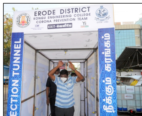
Disinfectant Tunnel in Erode bus stand