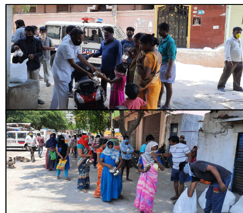
Distribution of Food Packets in Hyderabad

Yi Hyderabad: Yi Hyderabad Chapter has offered 40 Rooms of Hotel Inner Circle to Telangana Government for Self-Quarantine stay and kitchen facility for doctors on duty. They have distributed 2,400 packets of cooked food to the medical staff of Koti Hospital and the impoverished communities. Through a unique association with the Telangana police, the members have distributed 9,700 food packets in the city. They have also identified 5 locations for quarantine purposes in the city.