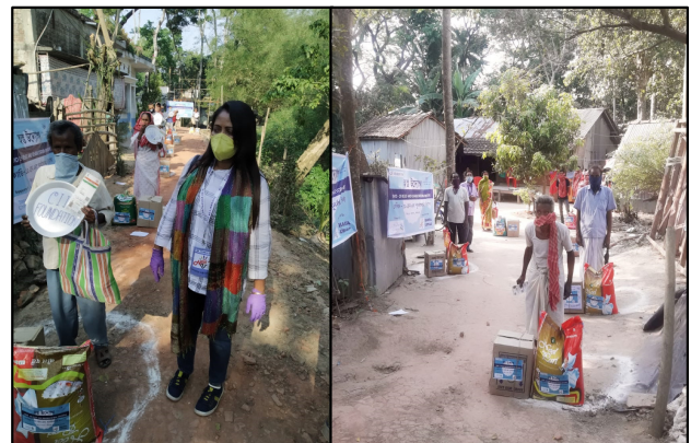
Distribution pictures from North 24 Parganas, West Bengal