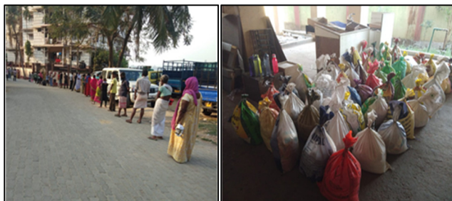
Distribution of ration in Guwahati

Yi Bhubaneswar: Chapter members with the support of NGO Ashayen distributed biscuits, soaps and sanitary napkins to 200 street kids. They also distributed dry food packets for 350 families at Brahnagiri with the support of NGO Hunger Free Odisha.