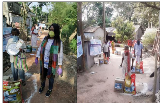
Distribution of food in North 24 Parganas, West Bengal

▪ Working with farmers in 110 villages in Ludhiana and Patiala, Punjab and 10 villages in Fatehabad and Sirsa, Haryana , CII Foundation is promoting safe hygienic practices. An awareness drive is being run through a network of farmer volunteers, with support of NGO partners GBDSGNS Foundation and Doctors For You.