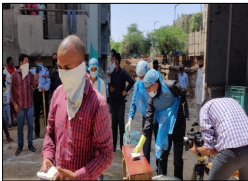
Distribution of meals in Delhi