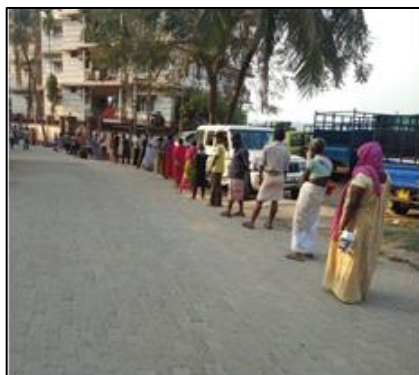
Distribution of ration in Guwahati

Yi Puducherry: Yi Puducherry distributed 4 gas connections with stoves for migrant workers who are in the construction industry and distributed 300 food packets and water to the on-duty policemen.