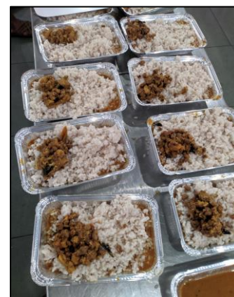
Meal distribution in Kerala