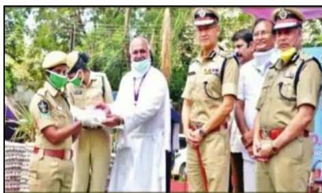
Distribution of Eggs in Andhra Pradesh