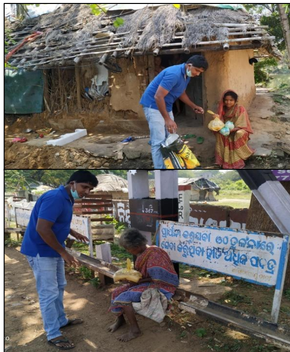
Distribution of food among the leprosy affected in Jajpur, Odisha

5,000 masks (manufactured by the women Self Help Groups of JSPL Foundation) and 5,000 sanitizers were distributed in Angul . 200 isolation beds were provided in Balasore to the District Administration. In Kalinga Nagar , 3,000 beneficiaries were served with cooked food and 1,500 ration kits were distributed. Pradeep Phosphates has distributed 3,000 cooked meals to the slum dwellers in the city of Paradeep . In collaboration with Jindal Stainless Steel, cooked meals were distributed among 53 families across 3 communities in Jajpur , where the main beneficiaries were from underprivileged families having leprosy affected members. In Cuttack, distribution of cooked meals was undertaken, 500 meals are distributed every day. Hotel Mayfair in Bhubaneshwar has provided masks, gloves, sanitizers and thermal monitors for the 30 staffers and also provides cooked food and rooms for them.