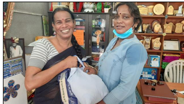
Distribution of ration in the Transgender Community

In Thoothukudi , 2,600 mask, 1,40,000 Gloves, 25 PPE suits and sanitizers have been distributed within the city and government offices. An approximate of over 1.4 lakh beneficiaries have benefitted from these initiatives.