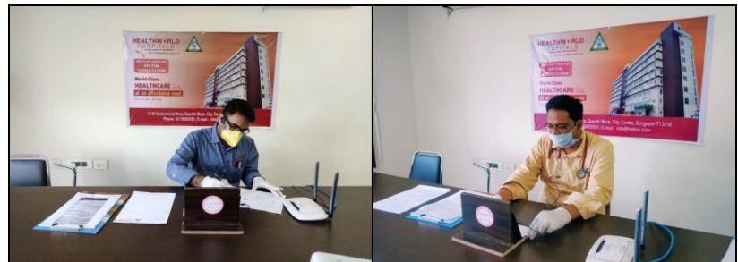
Healthworld Hospital Doctor attending consultation calls

Initiative with Healthworld: CII in association with Healthworld Hospitals has started medical consultations through WhatsApp video calls. This facility is available for the residents of Durgapur and Asansol from 10am to 5pm. Through this service, it is aimed to reduce the number of people coming to the hospital and hence the risk of infection spreading.