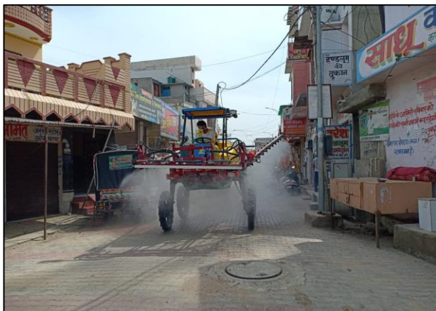
Sanitization Drive in Haryana