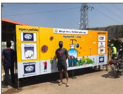
Disinfection Tunnel for essential services, Yi Tiruppur

Yi Kolkata: Yi Kolkata Chapter members with support of police started distributing ration kits to the St Joseph's Old Age Home covering 150 elderly people and supporting the village of Uttar Bilandopur with food essentials. A total of 1,050 ration packets have been distributed in the city.