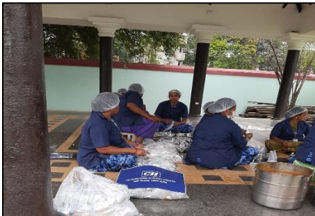
Ration kits Distribution in Bhilai, Chhattisgarh