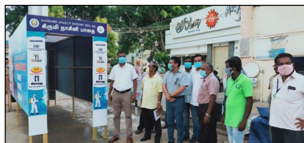
Disinfection Tunnel in Thoothukudi

In Thoothukudi , 2,600 mask, 1,40,000 Gloves, 25 PPE suits and sanitizers have been distributed within the city and government offices. An approximate of over 1.4 lakh beneficiaries have benefitted from these initiatives.