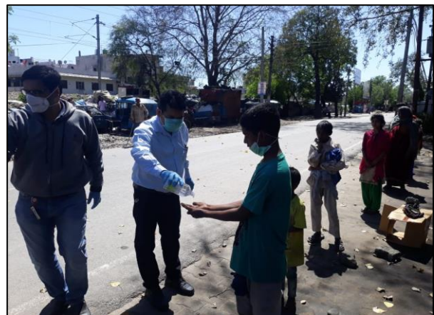
Haridwar Distribution of Meals