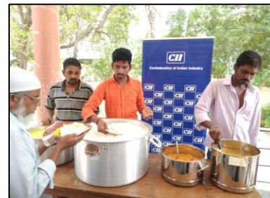
Distribution of cooked food in Tirupati