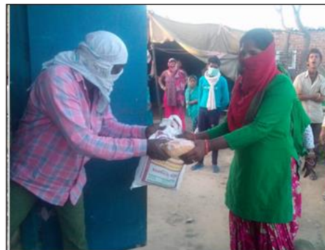
Yi Delhi Distribution

Yi Delhi: Yi Delhi Chapter reached out to help the needy in the Ghaziabad area, with the support of chapter Members. They have distributed 140 health kits and 550 cooked meals in the area.