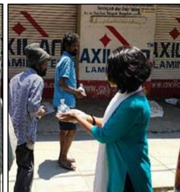
Distribution in Bengaluru