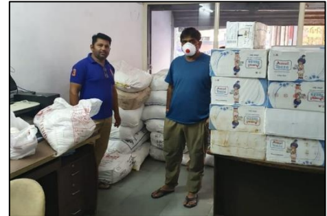
Procurement of material in Ahmedabad

Yi Ranchi: Yi Ranchi chapter members distributed 50 boxes of NaN and Lactogen baby food to Karuna Hriday Orphanage and helped elderly people with grocery and medicines in the city.