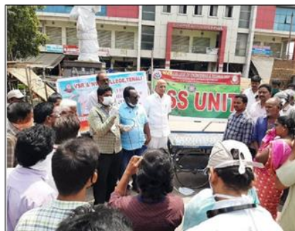
Amaravathi chapter awareness session

Yi Amaravathi: Chapter members distributed sanitizers for around 100 people at Tenali area.