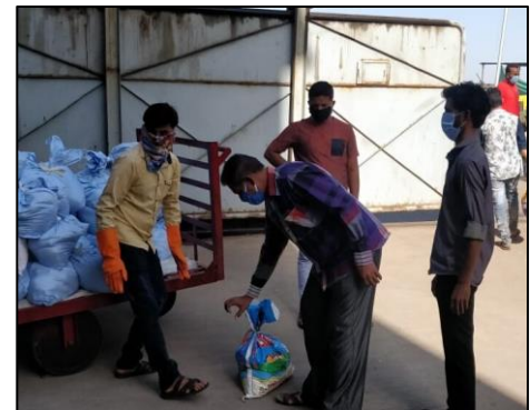
Distribution in Ahmedabad