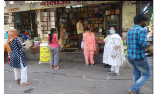
Distribution of ration with SEEDS in Delhi

In Delhi , 5,000 sanitizers have been distributed in various parts of Delhi by CII Delhi State Office. In partnership with NGO Pravah, sanitizers and masks were provided to 900 daily wage labourers. 500 Kgs of ration was distributed among 85 labourers through NGO Serve Samaan, and 887