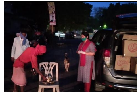
Distribution in Lucknow

Yi Hubballi: Yi Hubballi members distributed 137 packed lunches to the needy and old people in the city with the permission from City Commission. CII- Yi Hubballi chapter launched the disinfectant tunnel at the APMC Market for the use of public.