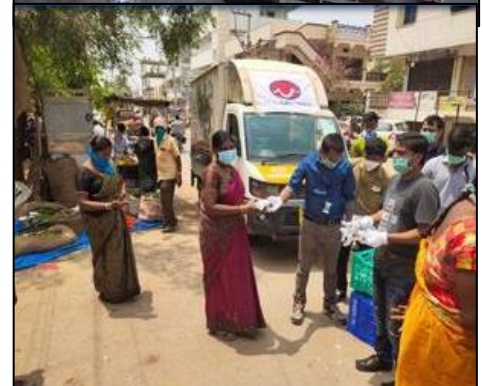
Relief work in Telangana