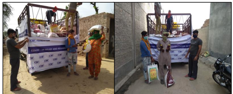
Ration Kit distribution in Sirsa, Haryana

▪ Working with farmers in 110 villages in Ludhiana and Patiala, Punjab and 10 villages in Fatehabad and Sirsa, Haryana , CII Foundation is promoting safe hygienic practices. An awareness drive is being run through a network of farmer volunteers, with support of NGO partners GBDSGNS Foundation and Doctors For You.