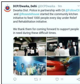
Dwarka Dist. Police's tweet on partnering with CII