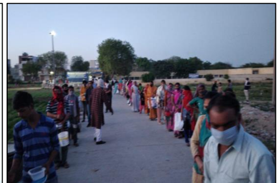
Roseate Hotel's Distribution of meals in Delhi