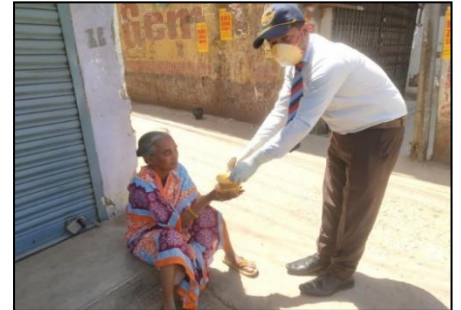
Meal distribution in Patna