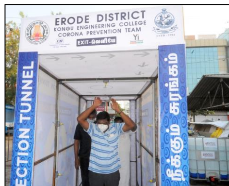
Disinfectant Tunnel in Erode bus stand

Yi Erode: CII- Yi Erode Chapter members with the support of Kongu Engineering College installed two disinfectant tunnels at the Perundurai bustand and GTS Schools which is now converted as vegetable market. The chapter also distributed 2,525 cooked food packets to the underprivileged people of the area.