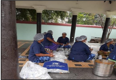
Ration kits Distribution in Bhilai, Chhatisgarh