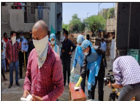
Distribution of meals in Delhi