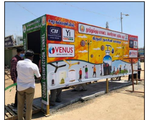
Disinfectant tunnel in Thoothukudi

Yi Thoothukudi: Yi Thoothukudi Chapter members distributed 1,000 masks, 15,000 gloves to the police department in the Nagarcoil area, 10 Safety dresses to the SP Office in Tirunelveli. 50,000 gloves to the government hospital, 15,000 gloves to banking sectors and 25,000 gloves were given to the Kerala police as a part of the relief measures. CII- Yi Thoothukudi Chapter members with the support of local district administration installed the disinfectant tunnel for the benefit of the public.