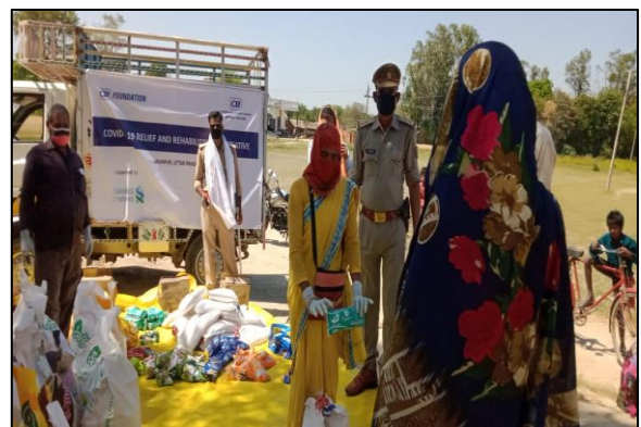
Distribution of Ration kits in Jaunpur