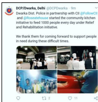
Dwarka Dist. Police's tweet on partnering with CII