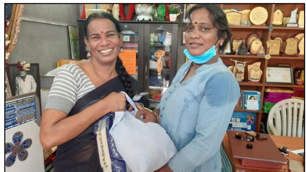
Distribution of ration in the Transgender Community