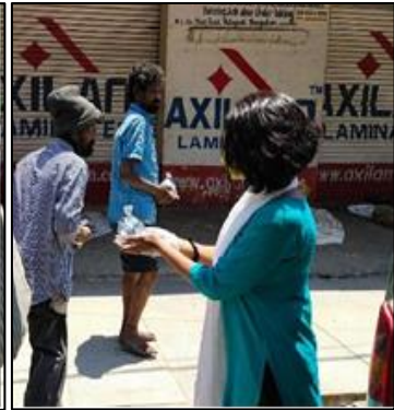
Distribution in Bengaluru

Copyright © 2020 Confederation of Indian Industry (CII). All rights reserved.