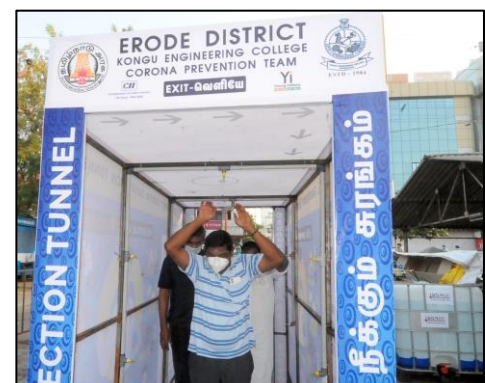
Disinfectant Tunnel in Erode bus stand