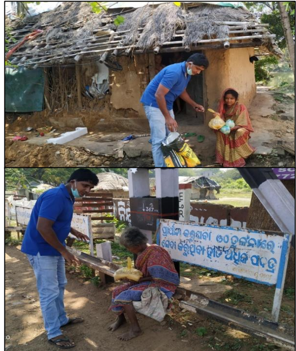
Distribution of food among the leprosy affected in Jajpur, Odisha

5,000 masks (manufactured by the women Self Help Groups of JSPL Foundation) and 5,000 sanitizers were distributed in Angul . 200 isolation beds were provided in Balasore to the District Administration. In Kalinga Nagar , 3,000 beneficiaries were served with cooked food and 1,500 ration kits were distributed. Pradeep Phosphates has distributed 3,000 cooked meals to the slum dwellers in the city of Paradeep . In collaboration with Jindal Stainless Steel, cooked meals were distributed among 53 families across 3 communities in Jajpur , where the main beneficiaries were from underprivileged families having leprosy affected members. In Cuttack, distribution of cooked meals was undertaken, 500 meals are distributed every day.