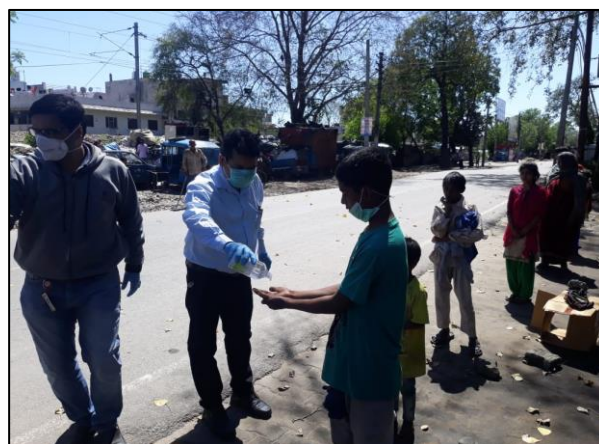
Haridwar Distribution of Meals