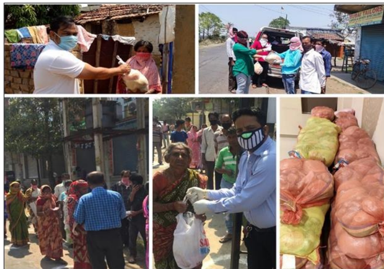
Food and ration distribution - through Ambuja Neotia, Kolkata

Working with the district administrations, CII has supported communities across 15 districts in West Bengal, distributing 37,500 masks, 5,000 gloves, 19,500 sanitizers, 9,500 ration kits and 7,100 packed meals amongst the most deprived communities across 15 districts in the state. Most of this work has been done in the remote hilly regions in West Bengal comprising districts of Coochbehar, Jalpaiguri, Darjeeling, Kalimpong , etc. In Kolkata , in a collaborative initiative, Ambuja Neotia group has extended medical support by converting 30 suites in its resort to quarantine centres, in Raichak, as per the need of the West Bengal government.