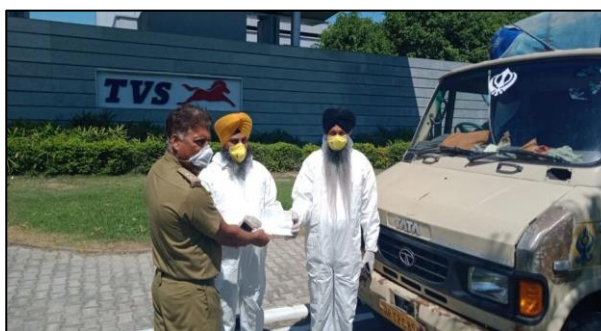
Sanitization and distribution of kits in Solan, Himachal Pradesh