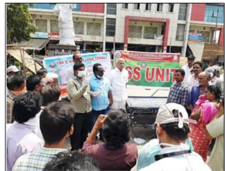
Amaravathi chapter awareness session

Yi Tiruppur: CII-Yi Tiruppur Chapter members in association with Tiruppur Corporations have installed the first disinfectant tunnel in the vegetable market.