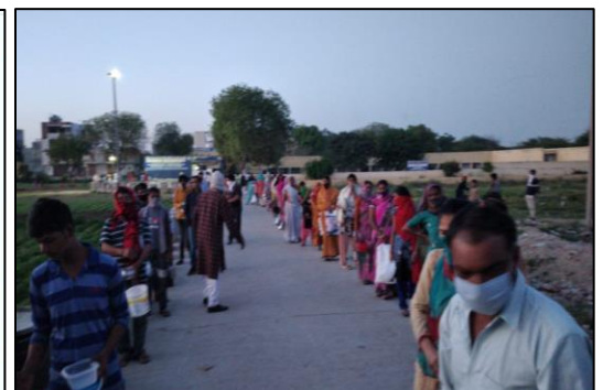
Roseate Hotel's Distribution of meals in Delhi