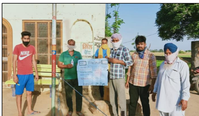
Awareness Session in Punjab

Working with farmers in 110 villages in Ludhiana and Patiala, Punjab and 10 villages in Fatehabad and Sirsa, Haryana , CII Foundation is promoting safe hygienic practices. An awareness drive is being run through a network of farmer volunteers, with support of NGO partners GBDSGNS Foundation and Doctors For You. Supported by CII, these villages have done pioneering work in solving the stubble burning problem over last two years. In Raikot, Ludhiana, 2 Audio vans have been put to service to travel from one village to another each day to spread awareness. 1,647 sanitizers have been distributed among needy farmers and village Anganwadi workers, in the presence of SDM Raikot and other district officials. In Sirsa, Haryana 235 ration kits have been distributed.