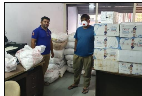
Procurement of material in Ahmedabad

Yi Jamshedpur: Yi Jamshedpur Chapter members identified a slum area with the support of Jamshedpur Notified Area Committee (JNAC) and distributed around 150 packets of relief material, including rice, pulses, flour, potatoes and salt, to the needy families.