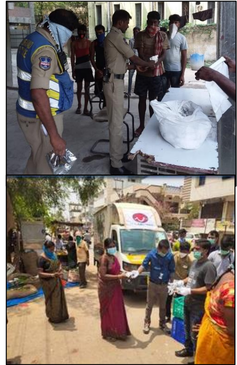
Relief work in Telangana