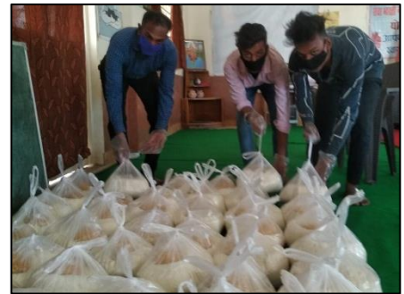
Food Distribution with Yi Bhopal

Yi Bhopal: This chapter, with the support of Seva Bharti, distributed cooked and raw food through 22 kitchens established in Bhopal at various locations. The Chapter also distributed soaps and ration to all the people living in Bhopal slums. So far, about 1,200 ration packets and 2,000 soaps have been distributed amongst the daily wage labourers in Bhopal. Furthering the support, Yi chapter members have contributed Rs 1 lakh to Police department to arrange for refreshments for 500 police officials and various volunteers working towards COVID – 19 relief.