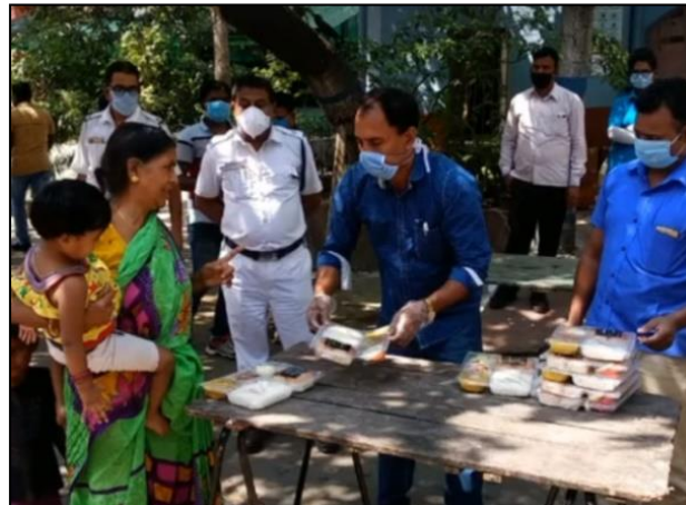
Food and Ration distribution, Asansol