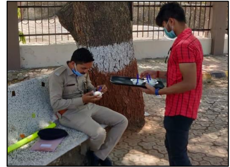
Food Distribution with Yi Rajkot

Yi Rajkot: This chapter tied up with an NGO (Shree Bolbala Charitable Trust) that cooks food and distributes it to 300 people with permission and support from local administration. Chapter members served 500 cooked food packets to the needy people and distributed 330 grocery kits to the nearby villages. Chapter members distributed 111 groceries packets to the construction site workers and 7,000 cooked meals to the destitute people.