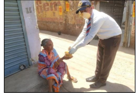
Meal distribution in Patna