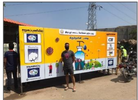
Disinfection Tunnel for essential services, Yi Tiruppur