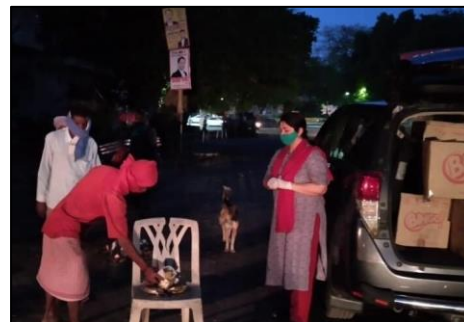
Distribution in Lucknow

Yi Hubballi: Yi Hubballi members distributed 137 packed lunches to the needy and old people in the city with the permission from City Commission. CII- Yi Hubballi chapter launched the disinfectant tunnel at the APMC Market for the use of public.