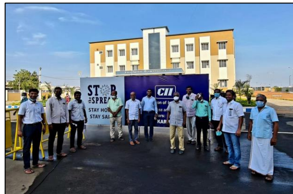
Disinfection Tunnel in Karur

distributed within the city and government offices. An approximate of over 1.4 lakh beneficiaries have benefitted from these initiatives. In Karur , a disinfectant tunnel has been set up in the community area for the benefit of people.