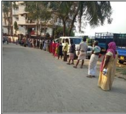
Distribution of ration in Guwahati