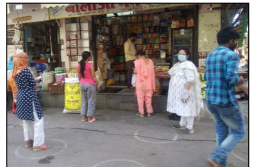
Distribution of ration with SEEDS in Delhi

In Delhi, 5,000 sanitizers have been distributed in various parts of Delhi by CII Delhi State Office. In partnership with the NGO Pravah, sanitizers and masks were provided to 900 daily wage labourers. 500 Kgs of ration was distributed among 85 labourers through NGO Serve Samaan, and 737 ration kits were distributed in East Delhi through the support of the NGO SEEDS. In collaboration with Oxfam, cooked meals are being distributed among the migrant labourers in 7 locations in Delhi. Till date, 16,335 meals have been distributed. In association with the Delhi police, Roseate hotel has distributed 500 packets of food within the city.