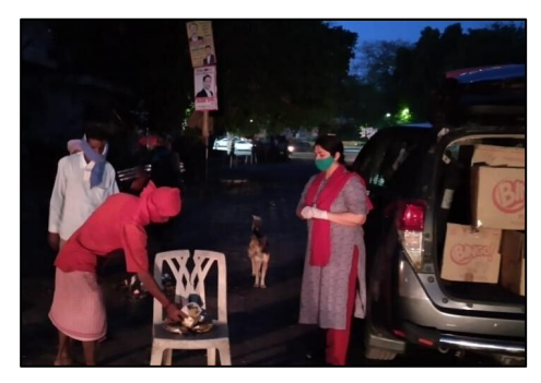
Distribution in Lucknow

Yi Madurai: Yi Madurai Chapter members supported 480 destitute families by providing hygiene items, hydration, packed food, medical supplies, food grains and monetary support. The camp was supported by a local NGO (Idhayam Arakatalai) with permission from the district administration.