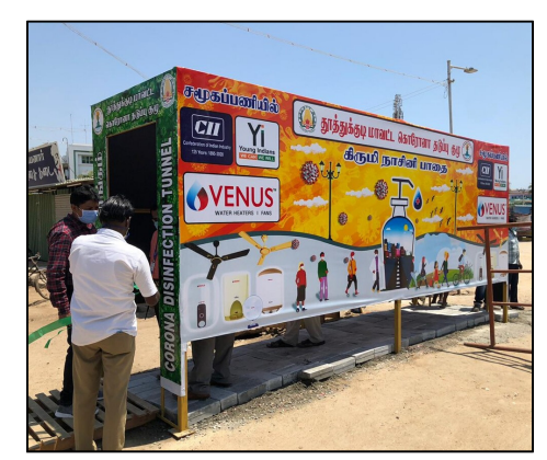
Disinfectant tunnel in Thoothukudi

Yi Guwahati: Yi Guwahati Chapter members distributed ration kits to 160 disadvantaged people in Kalipur area.