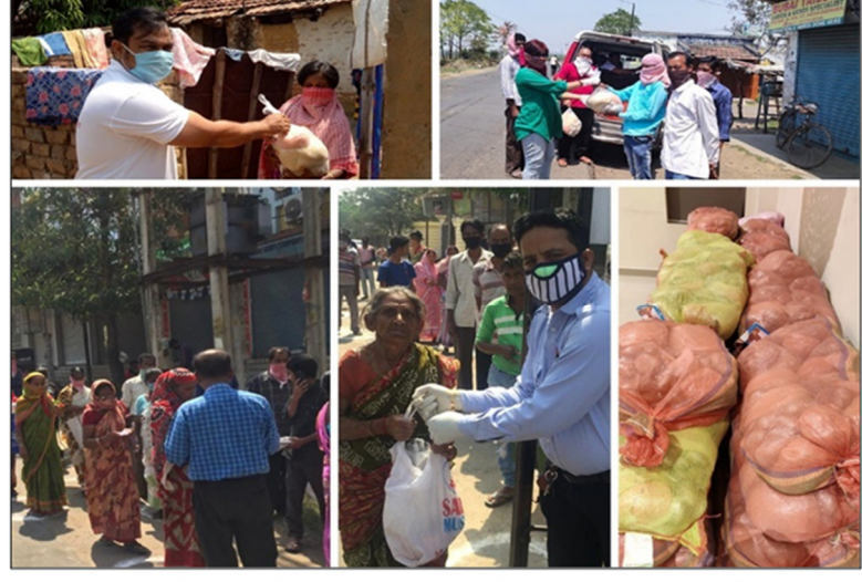
Food and ration distribution - through Ambuja Neotia, Kolkata

Working with the district administrations, CII has supported communities across 15 districts in