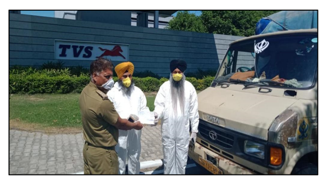
Sanitization and distribution of kits in Solan, Himachal Pradesh

• Uttar Pradesh: In collaboration with various organizations, 420 ration kits and 800 cooked meals and 400 masks were distributed in the urban slums of Lucknow. While in the district of Bareilly, 4,000 portions of cooked meals were served among the underprivileged communities of the city. With support of Dabur, 5,000 litres of fruit juices and Coconut water has been distributed along with sanitizers and face masks among the migrant labourers and the Police Personnel in Delhi, Dehradun, Ghaziabad. CII NR region in collaboration with industry members have undertaken relief work among migrant workers, daily wage earners and underprivileged – the details are provided below: