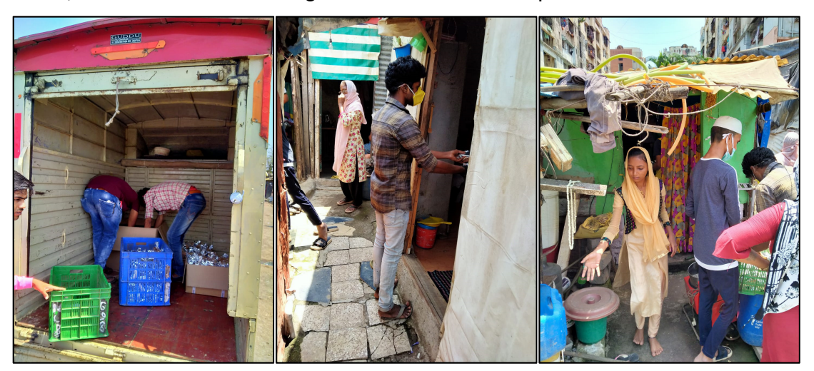
Distribution at Mankhurd

In Nashik, 2,000 PPE suits were given to the district hospital in Nashik.