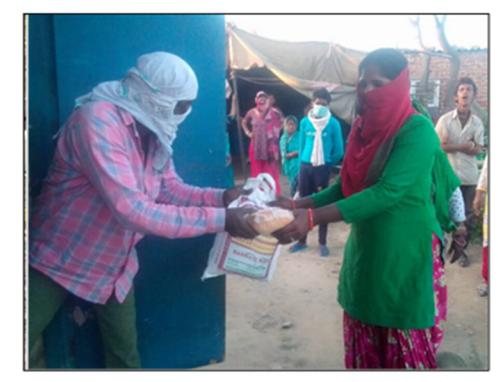
Yi Delhi Distribution

Yi Trivandrum: Yi Trivandrum has collected organic vegetables, in association with Agro Grun Ventures, and distributed to 100 needy families in Trivandrum.