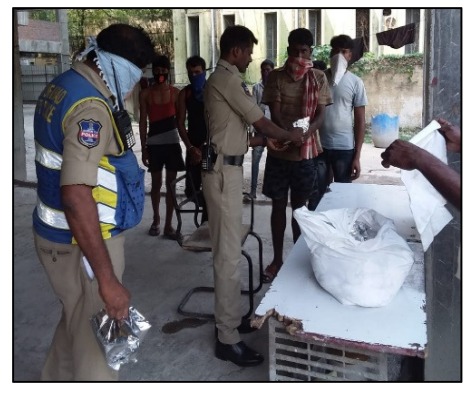
CII Telangana Distribution of food

Telangana: 10,000 health kits and ration kits have been procured and distributed within the state with efforts of CII. In Hyderabad, CII, in partnership with CII-IWN and Natco Trust, distributed 10,000 triple layered mask and 2,000 sanitizers to 3 Government Hospitals (Nilofur Hospital, Osmania Hospital, and Gandhi Hospital). 18,000 masks have been donated to the city police department by TCS Foundation.