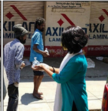
Distribution of ration in Guwahati