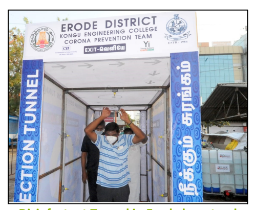
Disinfectant Tunnel in Erode bus stand

Yi Erode: Chapter members with the support of Kongu Engineering College installed the disinfectant tunnel at the Erode bus stand. Yi Erode Chapter started to deliver food packets for around 100 street dwellers everyday with permission and support from the local administration department.