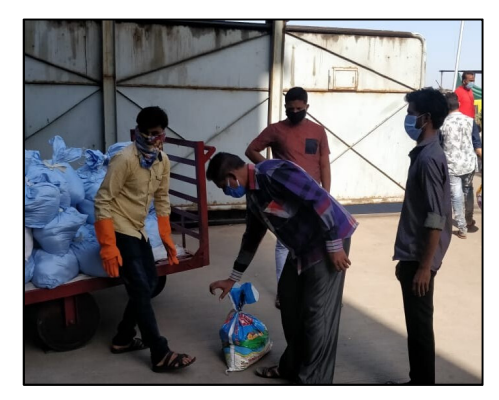
Distribution in Ahmedabad