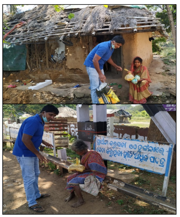
Distribution of food among the leprosy affected in Jajpur, Odisha