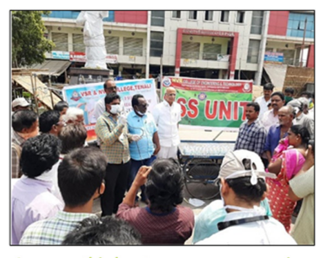
Amaravathi chapter awareness session

Yi Bhopal: This chapter, with the support of Seva Bharti, distributed cooked and raw food through 22 kitchens established in Bhopal at various locations. The Chapter also distributed soaps and ration to all the people living in Bhopal slums. So far, about 1,200 ration packets and 2,000 soaps have been distributed amongst the daily wage labourers in Bhopal. Furthering the support, Yi chapter members have contributed Rs 1 lakh to Police department to arrange for refreshments for 500 police officials and various volunteers working towards COVID – 19 relief.