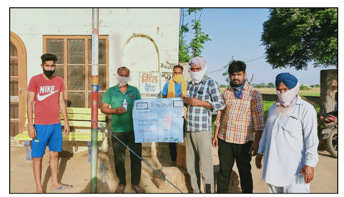
Awareness Session in Punjab

done pioneering work in solving the stubble burning problem over last two years. In Raikot, Ludhiana, 2 Audio vans have been put to service to travel from one village to another each day to spread awareness. 1,615 sanitizers have been distributed needv farmers and among village Anganwadi workers, in the presence of SDM Raikot and other district officials. In Sirsa. ration kits have been Harvana 50 distributed.