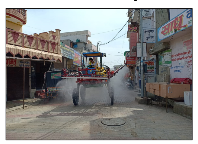
Sanitization Drive in Haryana