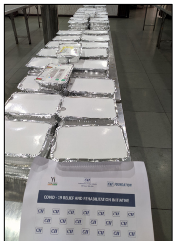
Food packet distribution in Kerala