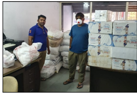
Procurement of material in Ahmedabad