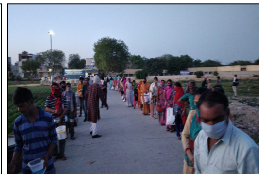
Distribution of meals in Delhi