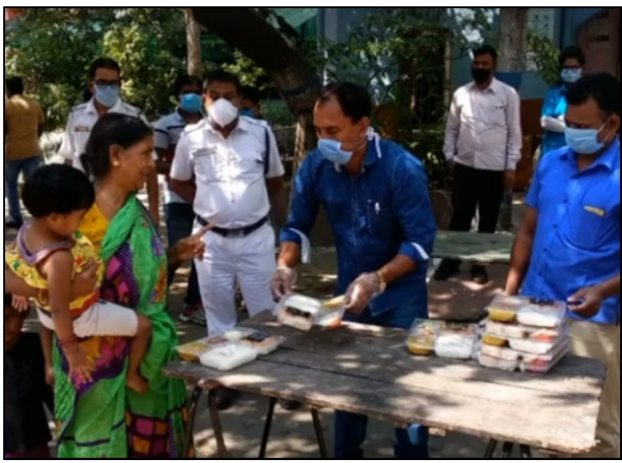
Food and Ration distribution. Asansol