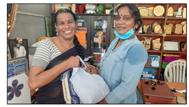
Distribution of ration in the Transgender Community