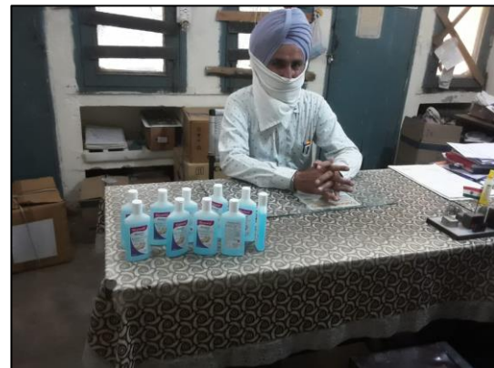
Sanitizer distribution in villages in Raikot, Ludhiana, Punjab

Working with farmers in 115 villages in Ludhiana and Patiala in Punjab and Jhajjar, Fatehabad and Sirsa in Haryana , CII Foundation is promoting safe hygienic practices. An awareness drive is being run through a network of farmer volunteers, with support of NGO partners GBDSGNS Foundation and Doctors For You. Supported by CII, these villages have done pioneering work in checking the stubble burning problem in last two years. In Raikot, Ludhiana, two Audio vans have been put to service to travel from one village to another each day to spread awareness. 1,938 sanitizers have been distributed among disadvantaged farmers and village Anganwadi workers, in the presence of SDM Raikot and other district officials. In Sirsa, Haryana, in partnership with Sona Comstar, 800 ration kits have been distributed among small farmers and farm labourers. Over next few days, this support will be extended to 2,500 families in Sirsa and Fatehabad. CII Foundation has initiated relief work with 2,000 families in Jhajjar in Haryana in partnership with Jhajjar Power Ltd. Till date, 300 families have received ration kits.