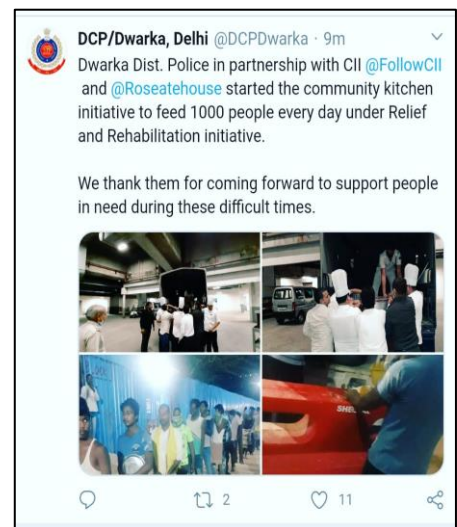
Dwarka Dist. Police's tweet on partnering with CII