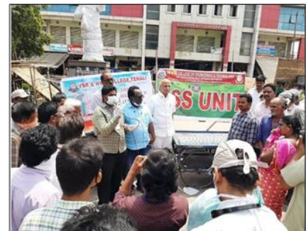
Amaravathi chapter awareness session

Yi Rajkot: This chapter tied up with an NGO (Shree Bolbala Charitable Trust) that cooks food and distributes it to 300 people with permission and support from local administration. The Chapter members served 500 cooked food packets to the needy people and distributed 330 grocery kits to the nearby villages. The chapter members distributed 111 grocery