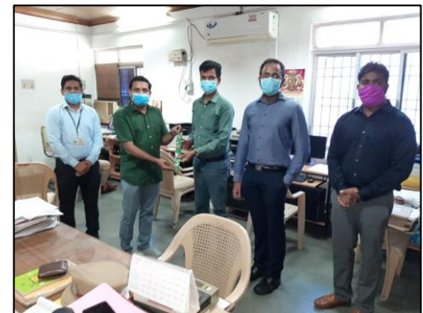
YI Puducherry distribution

Yi Chennai: Chapter members with the support of other organizations have collectively distributed around 332 dry ration kits across various vulnerable communities of Chennai.