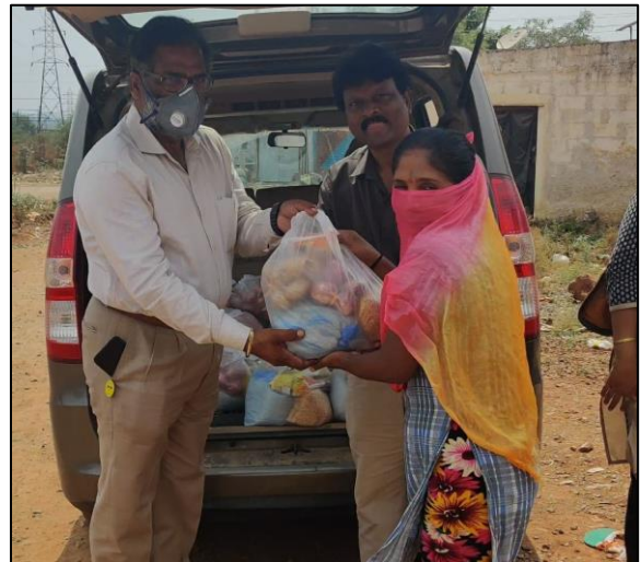
Distribution of Ration Kits by the Chairman, CII Hubballi