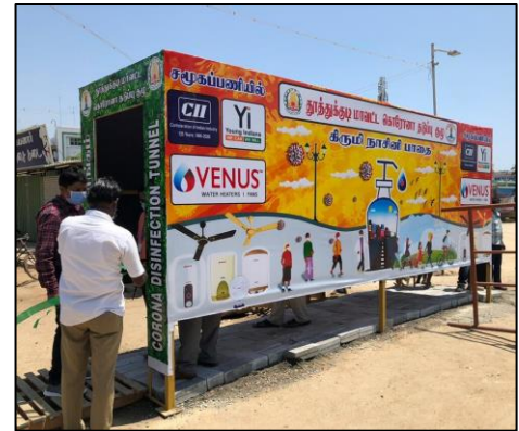
Disinfectant tunnel in Thoothukudi

Yi Thoothukudi: Yi Thoothukudi Chapter members distributed 1,000 masks, 15,000 gloves to the police department in the Nagarcoil area, 10 Safety dresses to the SP Office in Tirunelveli. 50,000 gloves to the government hospital, 15,000 gloves to banking sectors and 25,000 gloves were given to the Kerala police as a part of the relief measures. CII- Yi Thoothukudi Chapter members, with the support of local district administration, installed three disinfectant tunnels for the benefit of the public.