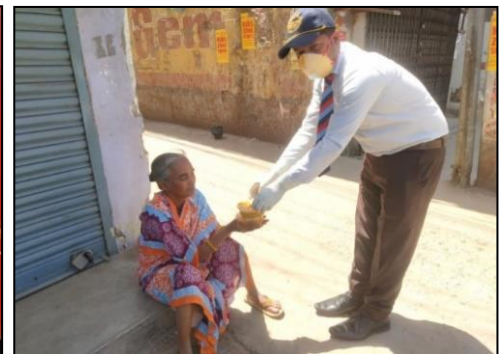
Meal distribution in Patna