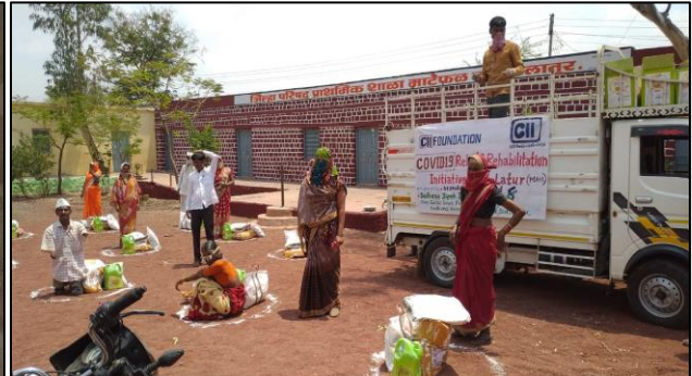
Distribution of ration kits in the destitute household of Latur District, Maharashtra.

Working with farmers in 115 villages in Ludhiana and Patiala in Punjab and Jhajjar, Fatehabad and Sirsa in Haryana , CII Foundation is promoting safe hygienic practices. An awareness drive is being run through a network of farmer volunteers, with support of NGO partners GBDSGNS Foundation and Doctors For You. Supported by CII, these villages have done pioneering work in checking the stubble burning problem in last two years. In Raikot, Ludhiana, two Audio vans have been put to service to travel from one village to another each day to spread awareness. 1,938 sanitizers have been distributed among disadvantaged farmers and village Anganwadi workers, in the presence of SDM Raikot and other district officials. In Sirsa, Haryana, in partnership with Sona Comstar, 800 ration kits have been distributed among small farmers and farm labourers. Over next few days, this support will be extended to 2,500 families in Sirsa and Fatehabad. CII Foundation has initiated relief work with 2,000 families in Jhajjar in Haryana in partnership with Jhajjar Power Ltd. Till date, 300 families have received ration kits.