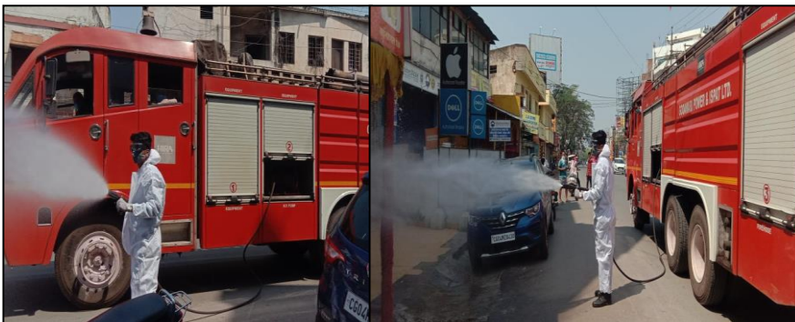
Sanitization of Raipur City