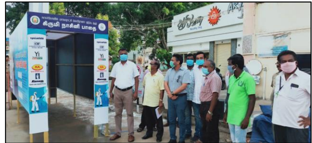
Disinfection Tunnel in Thoothukudi

In Coimbatore , a disinfectant tunnel has been set up in the community area for the benefit of people.