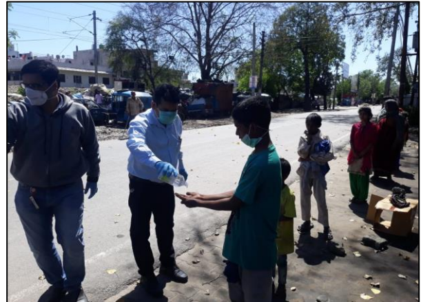
Haridwar Distribution of Meals