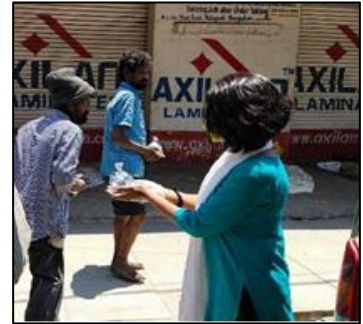
Distribution in Bengaluru

Yi Bengaluru: Yi Bengaluru Chapter distributed food packets to 300 people in collaboration with the Bruhat Bengaluru Mahanagara Palike (BBMP). Bengaluru chapter members identified 50 migrant labourers from Orissa and distributed staples and ration provisions in Whitefield area. Chapter members have distributed 8,946 ration kits in various underprivileged communities in the city.