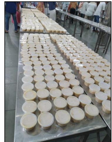
Distribution of Payasam in Cochin on the occasion of Easter