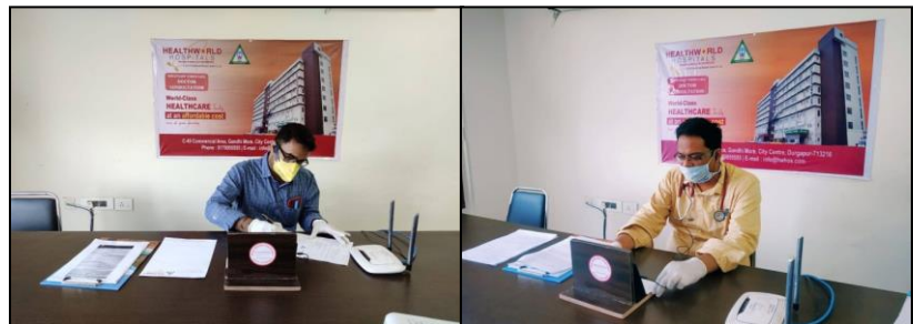
Healthworld Hospital Doctor attending consultation calls

Initiative with Healthworld: CII in association with Healthworld Hospitals has started medical consultations through WhatsApp video calls. This facility is available for the residents of Durgapur and Asansol from 10am to 5pm. Through this service, it is aimed to reduce the number of people coming to the hospital and hence the risk of infection spreading. Health world hospitals have also distributed 1,000 masks to Kolkata Metro workers.