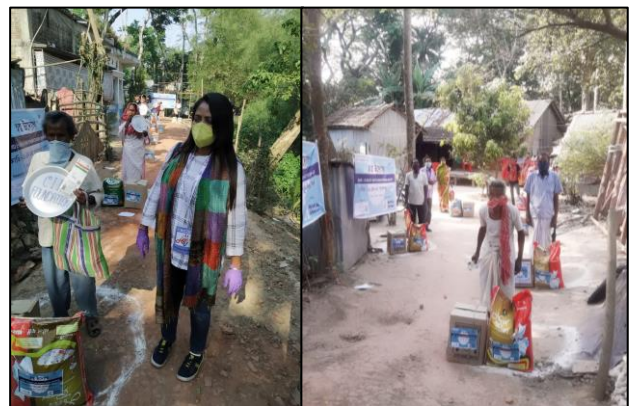
Distribution pictures from North 24 Parganas, West Bengal