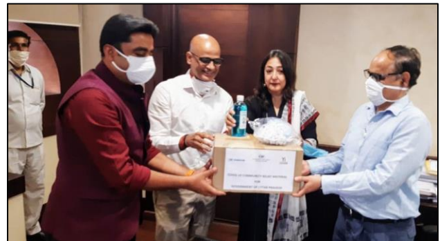
Medical equipment being handed over to the UP Govt. by CII in Lucknow

CII NR in collaboration with industry members have undertaken relief work among migrant workers, daily wage earners and underprivileged – the details are provided below: