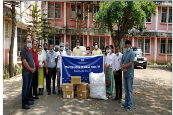
Ration Kit distribution in Nagaland