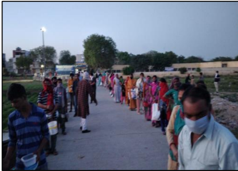
Roseate Hotel's Distribution of meals in Delhi