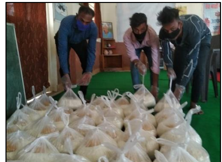
Food Distribution with Yi Bhopal

Yi Bhopal: This chapter, with the support of Seva Bharti, distributed cooked and raw food through 22 kitchens established in Bhopal at various locations. The Chapter also distributed soaps and ration to all the people living in Bhopal slums. So far, about 1,200 ration packets and 2,000 soaps have been distributed amongst the daily wage labourers in Bhopal. Furthering the support, Yi chapter members have contributed Rs 1 lakh to Police department to arrange for refreshments for 500 police officials and various volunteers working towards COVID – 19 relief. Chapter members with the support of Akshaya Patra Foundation and LNCT University prepared 50,000 raw food packets of ration provisions and distributed 10,000 packets to the indigent people. With the support of I-PAC and Swiggy, distribution of 1,000 food packets to the BMC, Bhopal, hospital patients, and slum residents of the area was undertaken.