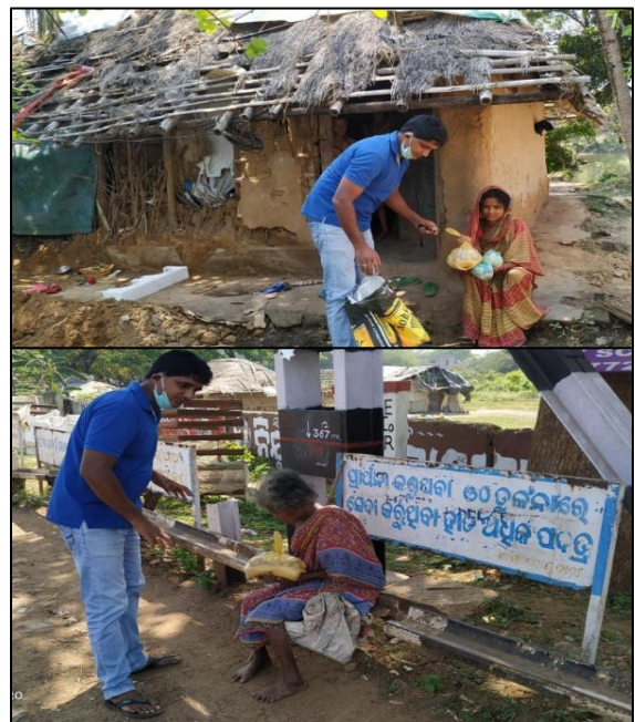
Distribution of food among the leprosy affected in Jajpur, Odisha

Jajpur: In collaboration with Jindal Stainless Steel, cooked meals were distributed among 53 families across 3 communities in Jajpur, where the main beneficiaries were from underprivileged families having leprosy affected members. Tata Steel Ltd has set up 150 beds with ventilators for the coronavirus affected patients.