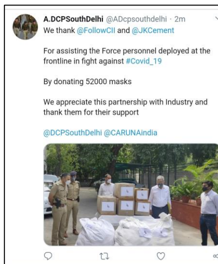
DCP South Delhi's tweet on receiving Masks from JK Cement

In partnership with JK Cement 52,000 masks have been handed over to the Delhi Police. In partnership with Oriflame India, 5000 masks have been provided t