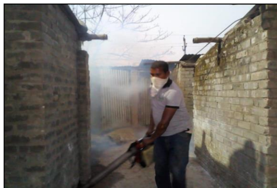
Fumigation in Cuttack by Metro Builders

In Cuttack , distribution of cooked meals was undertaken, 500 meals are distributed every day. Metro Builders has distributed food packets to 2,000 poor families at Buxi Bazar and took up the responsibility to fumigate the slum areas.