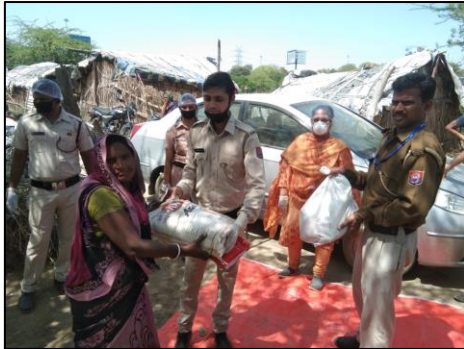
Distribution of Ration kits with SEEDS

CII in partnership with Marico and Delhi Police is providing daily meals to 1,000 needy people.