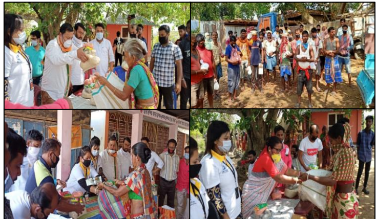
PMKK food distribution drives