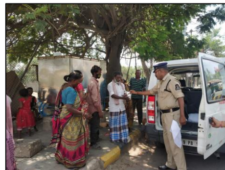
Yi Hyderabad Distribution

Yi Hyderabad: Yi Hyderabad Chapter has offered 40 Rooms of Hotel Inner Circle to Telangana Government for Self-Quarantine stay and kitchen facility for doctors on duty. They have distributed 2,400 packets of cooked food to the medical staff of Koti Hospital and the impoverished communities. Through a unique association with the Telangana police, the members have distributed 9,700 food packets in the city. They have also identified 5 locations for quarantine purposes in the city.