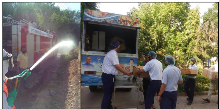
Distribution of ration kits and sanitization in Himachal Pradesh with TVS

With support of Mahindra Group, community kitchens have been made operational in Mahindra plant facilities across cities including Nasik, Jaipur, Nagpur, Kandivli, Zaheerabad, etc.