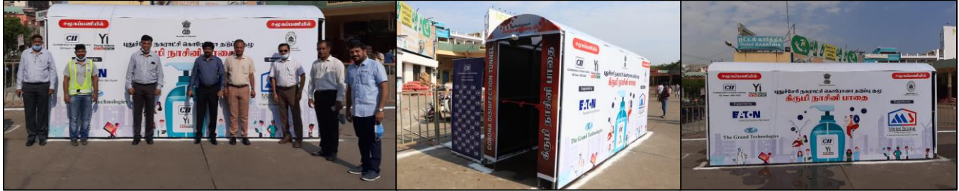
Disinfection Tunnel in Puducherry

individuals with their problems. In partnership with Sujatha Bio Tech and Puducherry Municipality and Police Department, over 65,000 health and hygiene kits were distributed in