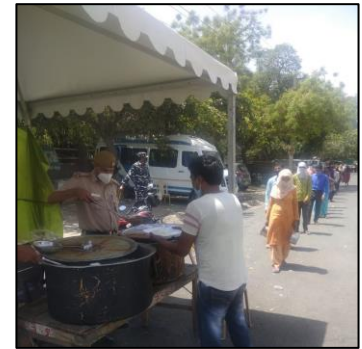
Le Méridien's Distribution of Meals