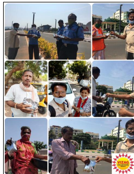
Yi Vizag Distribution

Yi Jaipur: Yi Jaipur Chapter members, with support of NIMS College Canteen, started distributing 200 packets of cooked food and 450 ration kits amongst the underprivileged communities. The chapter has also provided bird feed during the lockdown.