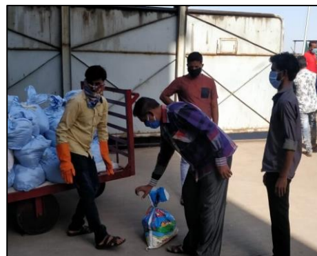
Distribution in Ahmedabad

Yi Ahmedabad: Yi Ahmedabad Chapter members distributed milk and grocery kits to 970 slum dweller families at Old Vadaj, Bhimajipur. Chapter members with the support of Weizmann Ltd Ahmedabad, distributed one-month ration provision to its 600 Daily wage employees. 1,000 anti COVID-19 sanitizing kits consisting of mask, gloves, sanitizer, soap & paper napkin to Western Railway, Ahmedabad Division on duty staff including Home Guards.