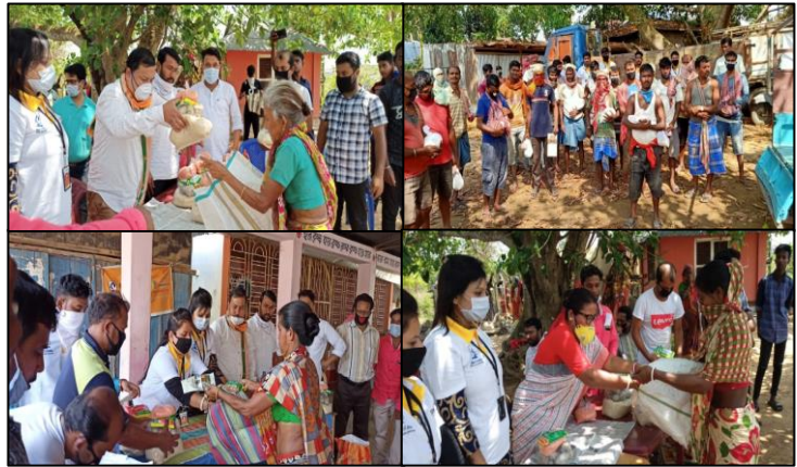
PMKK food distribution drives