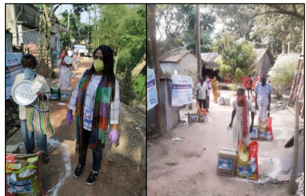
Distribution pictures from North 24 Parganas, West Bengal