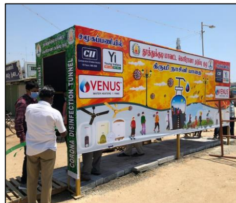
Disinfectant tunnel in Thoothukudi

Yi Thoothukudi: Yi Thoothukudi Chapter members distributed 1,000 masks, 15,000 gloves to the police department in the Nagarcoil area, 10 Safety dresses to the SP Office in Tirunelveli. 50,000 gloves to the government hospital, 15,000 gloves to banking sectors and 25,000 gloves were given to the Kerala police as a part of the relief measures. CII- Yi Thoothukudi Chapter members, with the support of local district administration, installed three disinfectant tunnels for the benefit of the public.