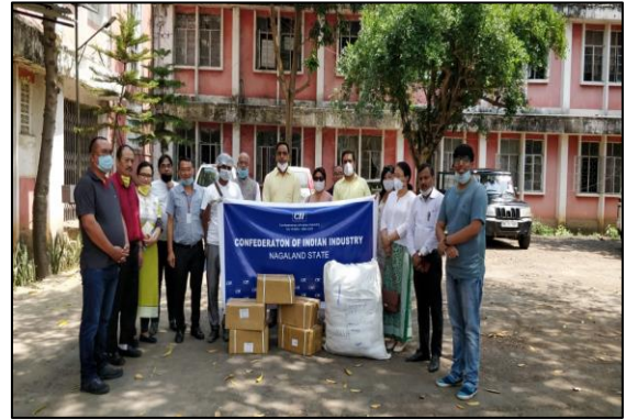
Ration Kit distribution in Nagaland