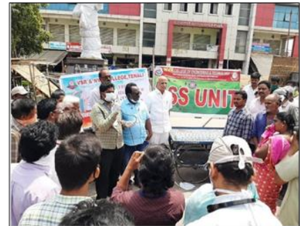
Amaravathi chapter awareness session

Yi Amaravathi: Chapter members distributed sanitizers for around 100 people at Tenali area.