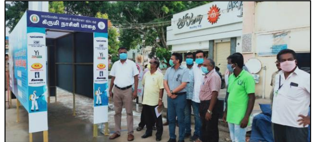
Disinfection Tunnel in Thoothukudi

In Thoothukudi, 2,600 mask, 1,40,000 Gloves, 25 PPE suits and sanitizers have been distributed within the city and government offices. An approximate of over 1.4 lakh beneficiaries have benefitted from these initiatives.