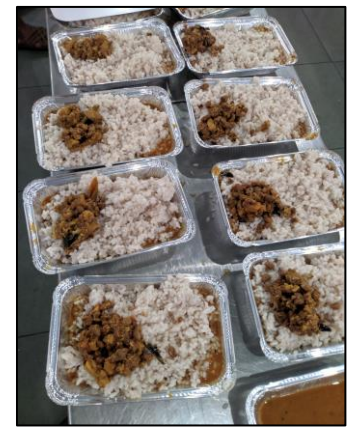
Meal distribution in Kerala