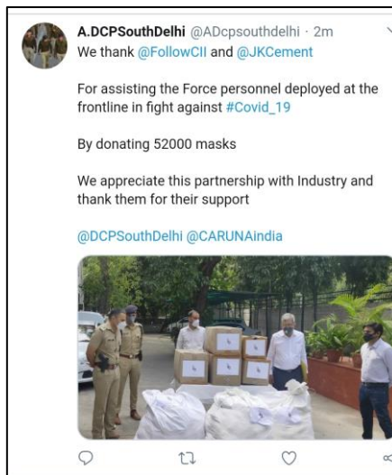
DCP South Delhi's tweet on receiving Masks from JK Cement

In partnership with JK Cement 52,000 masks have been handed over to the Delhi police.