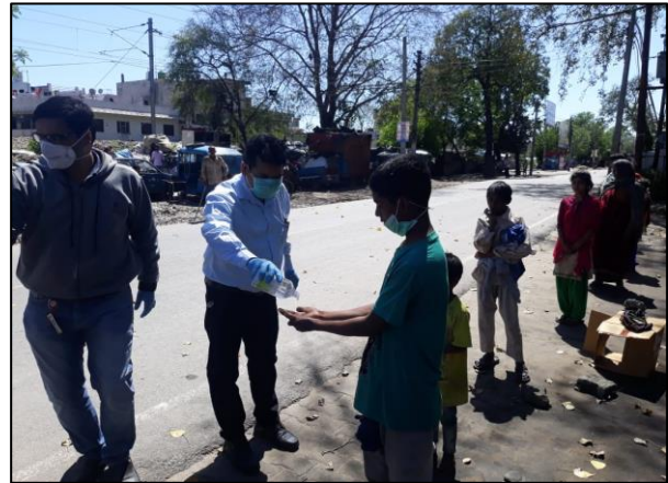
Haridwar Distribution of Meals