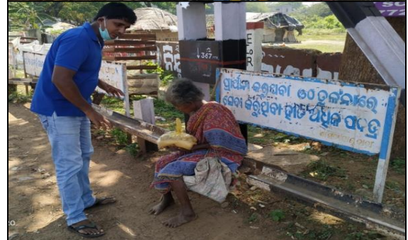
Distribution of food among the leprosy affected in Jajpur, Odisha