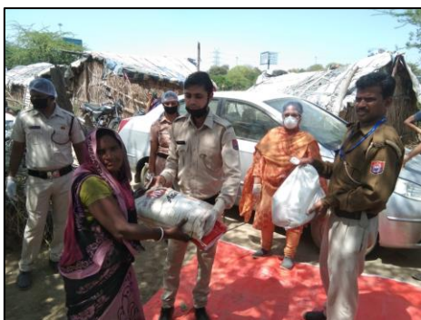
Distribution of Ration kits with SEEDS