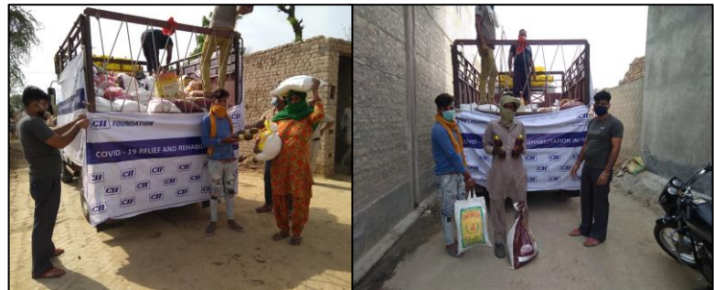
Ration Kit distribution in Sirsa, Haryana

Working with farmers in 115 villages in Ludhiana and Patiala in Punjab and Jhajjar, Fatehabad and Sirsa in Haryana , CII Foundation is promoting safe hygienic practices. An awareness drive is being run through a network of farmer volunteers, with support of NGO partners GBDSGNS Foundation and Doctors For You.