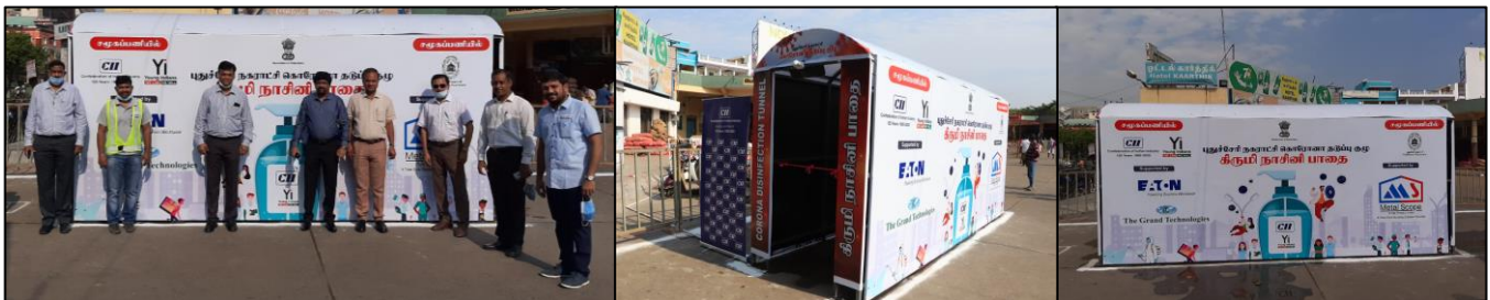
Disinfection Tunnel in Puducherry