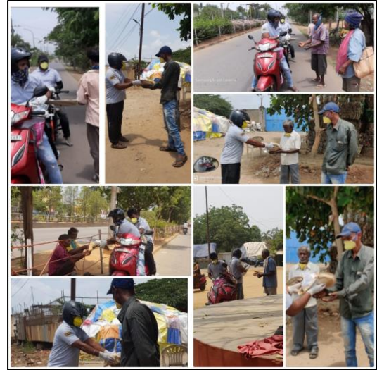
Distribution in Tirupati