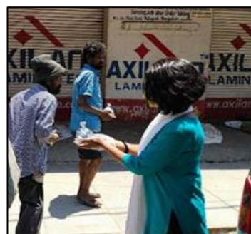
Distribution in Bengaluru

Yi Bhubaneswar: Chapter members with the support of NGO Ashayen distributed biscuits, soaps and sanitary napkins to 200 street kids. They also distributed dry food packets for 350 families at Brahnagiri with the support of NGO Hunger Free Odisha.