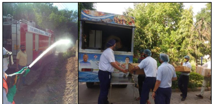
Distribution of ration kits and sanitization in Himachal Pradesh with TVS

With support of Mahindra Group, community kitchens have been made operational in Mahindra plant facilities across cities including Nasik, Jaipur, Nagpur, Kandivli, Zaheerabad, etc.