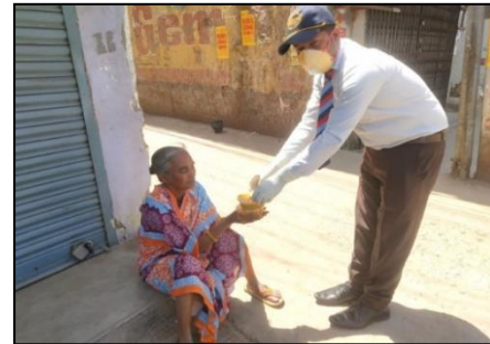
Meal distribution in Patna