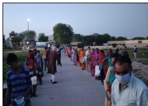
Roseate Hotel's Distribution of meals in Delhi