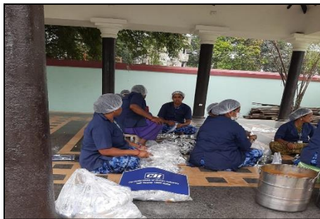
Ration kits Distribution in Bhilai, Chhatisgarh

Akshaya Patra Foundation. In Durg , Akshaya Patra Foundation is providing 4,600 cooked meals every day. In Raipur , 3,850 ration kits and cooked meals have been distributed by the municipal corporation, the meals are distributed daily.