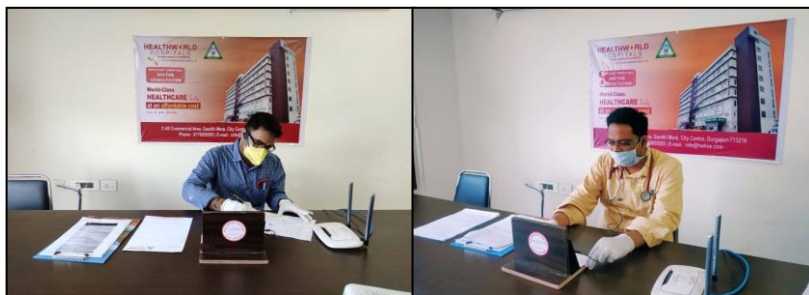
Healthworld Hospital Doctor attending consultation calls

Initiative with Healthworld: CII in association with Healthworld Hospitals has started medical consultations through WhatsApp video calls. This facility is available for the residents of Durgapur and Asansol from 10am to 5pm. Through this service, it is aimed to reduce the number of people coming to the hospital and hence the risk of infection spreading. Health world hospitals have also distributed 1,000 masks to Kolkata Metro workers.