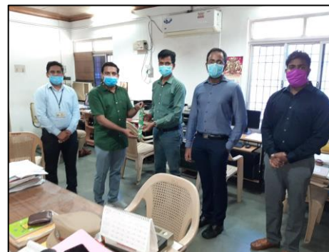
YI Puducherry distribution

Yi Chennai: Chapter members with the support of other organizations have collectively distributed around 332 dry ration kits across various vulnerable communities of Chennai.