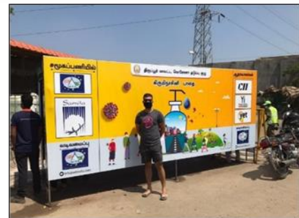
Disinfection Tunnel for essential services, Yi Tiruppur

Yi Tiruppur: CII-Yi Tiruppur Chapter members in association with Tiruppur Corporations have installed the first disinfectant tunnel in the vegetable market.