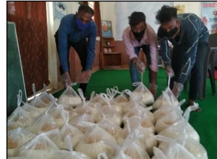
Food Distribution with Yi Bhopal

Yi Mysuru: Yi Mysuru chapter donated 100 mosquito repellents and hygiene products to the district hospital heads to be utilized for the quarantined patients.