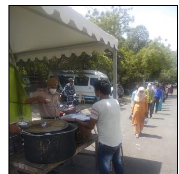
Le Méridien's Distribution of Meals