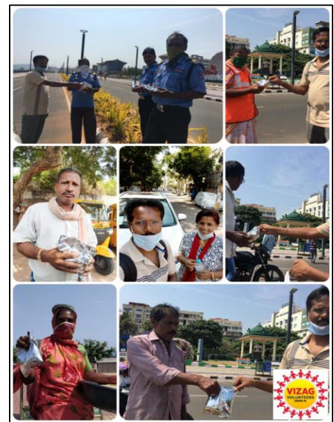
Yi Vizag Distribution

Yi Pune: This Chapter is initiating relief activities in collaboration with CII Foundation.