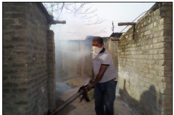
Fumigation in Cuttack by Metro Builders