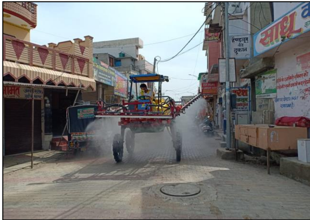
Sanitization Drive in Haryana