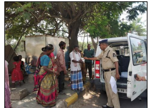
Yi Hyderabad Distribution

Yi Hyderabad: Yi Hyderabad Chapter has offered 40 Rooms of Hotel Inner Circle to Telangana Government for Self-Quarantine stay and kitchen facility for doctors on duty. They have distributed 2,400 packets of cooked food to the medical staff of Koti Hospital and the impoverished communities. Through a unique association with the Telangana police, the members have distributed 9,700 food packets in the city. They have also identified 5 locations for quarantine purposes in the city.