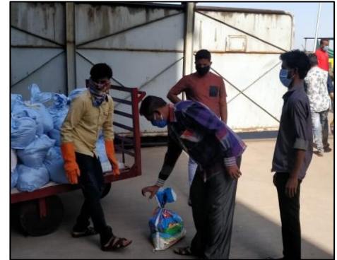
Distribution in Ahmedabad

Yi Ahmedabad: Yi Ahmedabad Chapter members distributed milk and grocery kits to 970 slum dweller families at Old Vadaj, Bhimajipur. Chapter members with the support of Weizmann Ltd Ahmedabad, distributed one-month ration provision to its 600 Daily wage employees. 1,000 anti COVID-19 sanitizing kits consisting of mask, gloves, sanitizer, soap & paper napkin to Western Railway, Ahmedabad Division on duty staff including Home Guards.