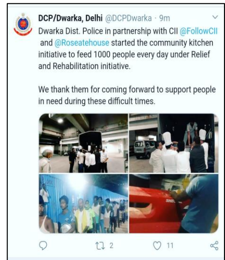
Dwarka Dist. Police's tweet on partnering with CII