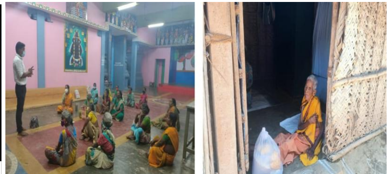
IWN Puducherry team distributed dry ration to the elderly people and conducted awareness sessions on COVID-19