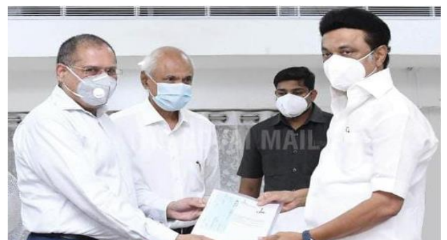
Contribution from Lakshmi Machine Works Ltd