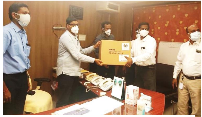
Poclain Hydraulics handing over 2 ventilators to Indira Gandhi Medical College, Puducherry