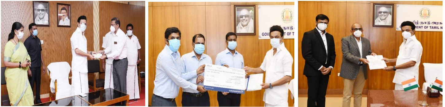
Contributions from Devadoss Hospitals Madurai, Grundfos Pumps, Danfoss Industries