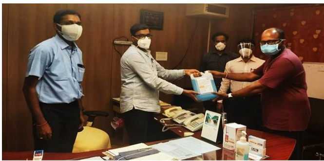
Pondy Pharmaceutical handing over 500 Litres of Sanitizer to Indira Gandhi Medical College, Puducherry