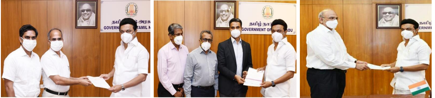
Contributions from Ponpure Chemicals, Kauvery Hospitals, TVS Logistics