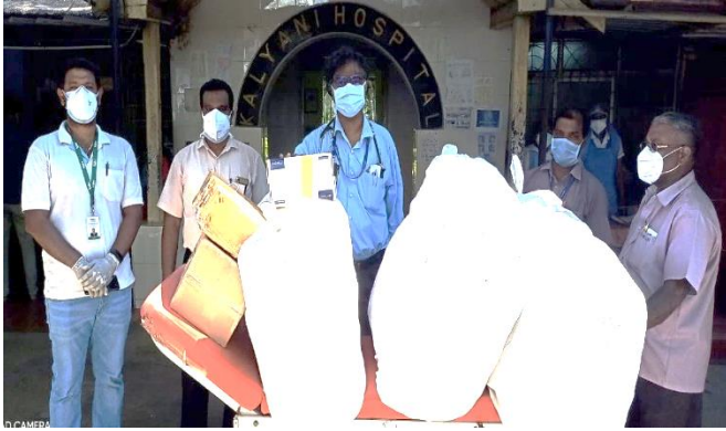
Control technologies contributed 150 PPE sets to CSI Kalyani hospital, Chennai