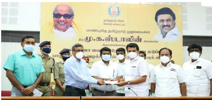
CII Salem have raised funds of Rs. 1,97,87,713/- Crore as on date for the CM Relief Fund