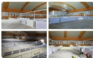
10:35 AM · 16 May 21 · Twitter for Android

CII Kerala is setting up a 500 bedded Covid Hospital at Adlux Convention Centre. After setting up it will be handed over to the Government of Kerala #CIIKerala @CII4SR #COVID19India