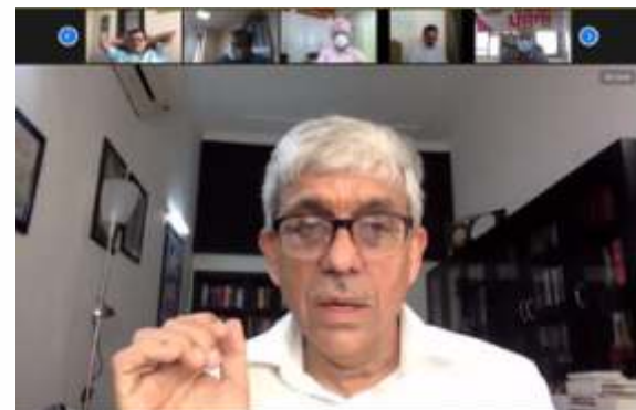
Interaction with Chief Principal Secretary to Chief Minister, Punjab