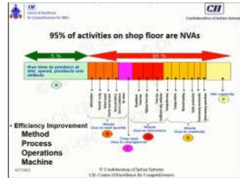
Online Program to Build Capability & Leadership to Achieve Zero Defect via Developing ZED Specialist