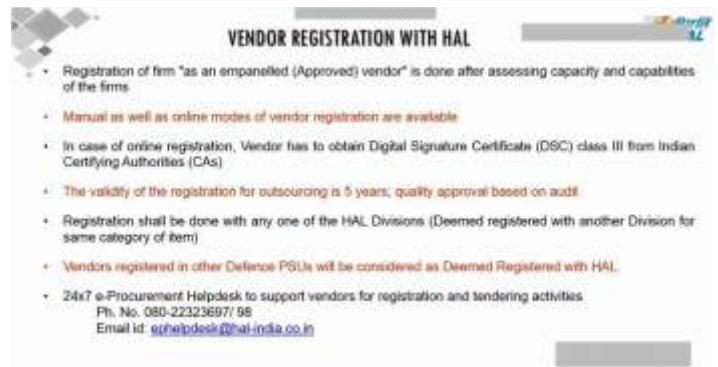
Program in Progress