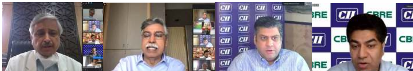
Interaction with Director, AIIMS in progress

availability of the beds, oxygen, healthcare staff etc. On the vaccination front, Dr Guleria informed the members that no vaccine is 100% efficient. One may get the infection but the antibodies in our body will not allow the virus to multiply and therefore will not have the severe disease.