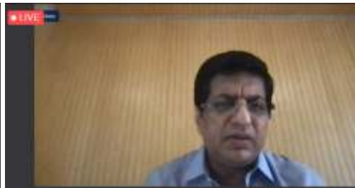
CII Electronics Manufacturing Summit 2021