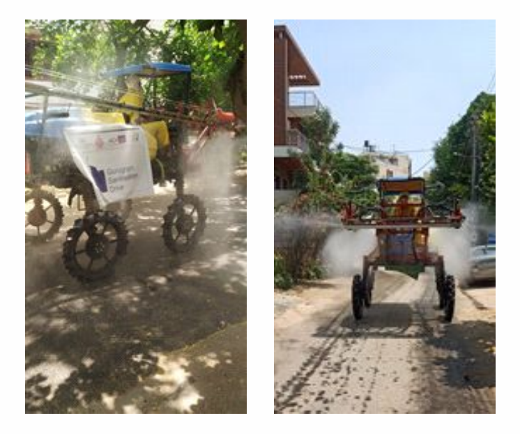
CII in association with the Municipal Corporation of Gurugram and PI Industries undertook Sanitization Drive in various areas of Gurugram